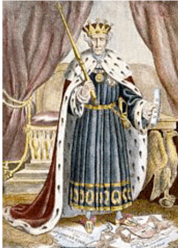
Andrew Jackson portrayed by his enemies as a monarch, trampling on the Constitution and abusing the veto power